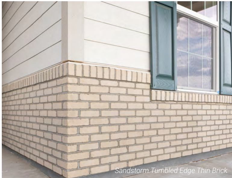
Sandstorm Tumbled Edge Thin Brick