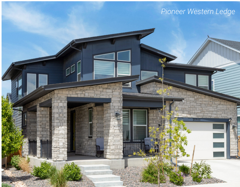
Pioneer Western Ledge